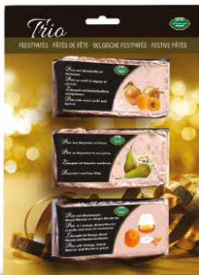
Trio of festive pâtés (481 466)