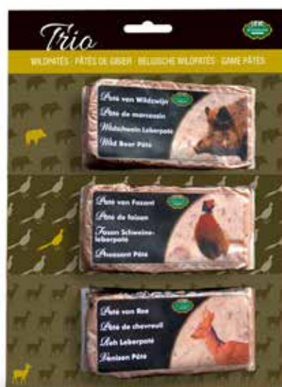
Trio of game pâtés (454 378)