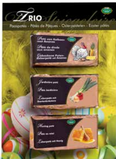
Trio of Easter Pâtés (577 420)